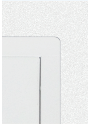
flush to the wall