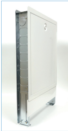
Depth 80 - 120 mm